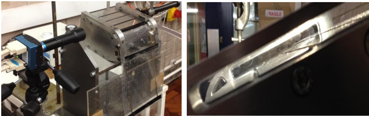
Figure 2 – Images of the experimental equipment. On the left is the full experimental setup showing the camera and lens in relation to the die. On the right is a view through the sapphire glass onto the slide with the slot exits being visible.